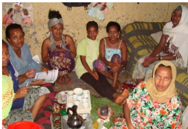
Figure 1: When Sex workers participated in peer education- Woldiya

PADet was also started community-based ART service in its Drop-in center in Woldiya. The DIC was staffed with necessary technical staff/ Pharmacy Technician, Laboratory technician and two trained Nurses/ and started providing HIV testing and counseling service. HCT service was provided to sex workers in the DIC and at outreach bases, ART service immediately in the DIC. It has become good options for those who were in difficulty to get ART services in public and other service providers. PLWHA associations in North Wollo have long years of experience in promoting positive living measures for their members and other HIV positive persons. Therefore, PADet has created referral systems with PLWHA associations in target towns to link newly tested and HIV positive persons to get psychosocial services. In this approach hundreds of new HIV positive sex workers got counselling services to adapt positive living mechanisms by the Association members which they also shared experiences on life skills.