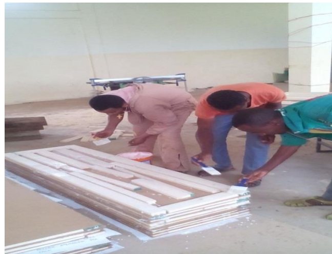
Sample Youths attending hard skill training

Based on their need, the project also organized vocational/hard skill training to unemployed and underemployed youth. So far, the project supported and facilitated hard skill training to 48 (25 female) youth on wood work, women hair dressing & cosmetology, mobile maintenance etc. The training was provided by Technic, Vocational, and Education Training College (TVET) and private collages. After the training