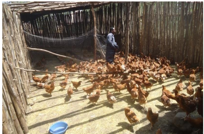
Figure 4 Youth field visit at Menjelo kebele of Raya Kobo Woreda at Local business man poultry production over 300 hens