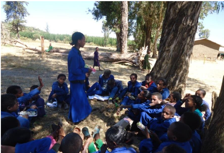
Figure 2:When children discussed in peers

The project invested a lot at community and community organizations level also. Community wide events, workshops, trainings were organized to build the knowledge and skills of community members at kebele level and to develop their skills to protect girls and other children from early marriage and labour abuse since they are the main perpetrator of the abuses.