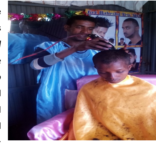
Figure 7, Muches Men's Beauty Salon

Positive Youth Development (PYD) training. He attained the training completely and able to change his future life. He explained the condition as: "I have learned so many things from the training and the training helps me to create my own job and because of that I am able to improve my livelihood". After the training he developed his behavior on customer handling and financial management skills. His attitude on, self-confidence and work commitment has also strongly improved. He has also developed a good saving plan, which will guide him