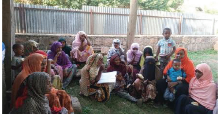
Figure 1: Wodajo village community conversation and saving group

This community transformed its migration practices through PADet's safer migration project, reducing illegal migration and empowering women through savings groups. Through PADet's safer migration project, women in Wodajo Kebele formed a self-help savings group, creating an alternative to migration. The initiative reduced unsafe migration and inspired 150 women to receive overseas employment training, with 18 successfully migrating legally . This success story demonstrates the power of community-driven solutions in addressing migration challenges and empowering women.